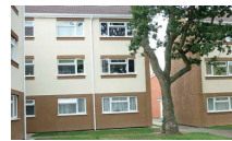
Flats on the North Milton Estate after refurbishment