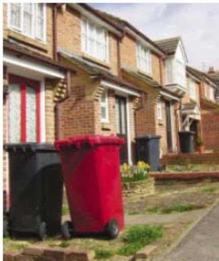
Unfortunately the lessons don't seem to have been learnt in this more recent development.