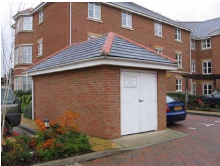
Here a waste storage building has been designed as an integral part of the development