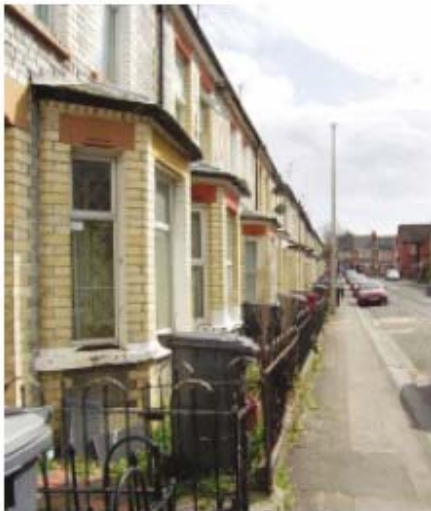
Shallow frontages in a traditional 19 th century terrace leave little scope for successful integration of bins waste storage

Consideration of the problems that arise in accommodating bins-waste storage facilities within the curtilage of existing dwellings can highlight issues that need to be addressed in looking at the design of new developments: