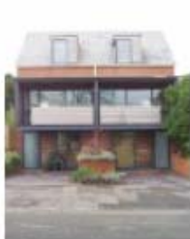
A pair of modern semis picking up the street rhythm where an accessible space for bins waste storage, meters and ancillary storage has been 'designed' as part of the balanced street facade