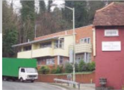
Modern infill on an awkward urban site still manages to physically define a space accommodating bins for waste storage.

Consideration of the problems that arise in accommodating bins-waste storage facilities within the curtilage of existing dwellings can highlight issues that need to be addressed in looking at the design of new developments: