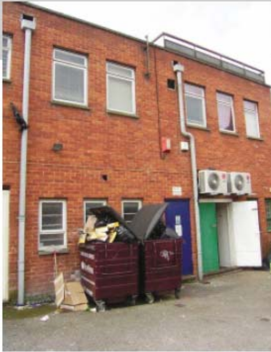
This illustrates the inevitable problems of unsightly accumulation of waste where no area is specifically allocated to bins.