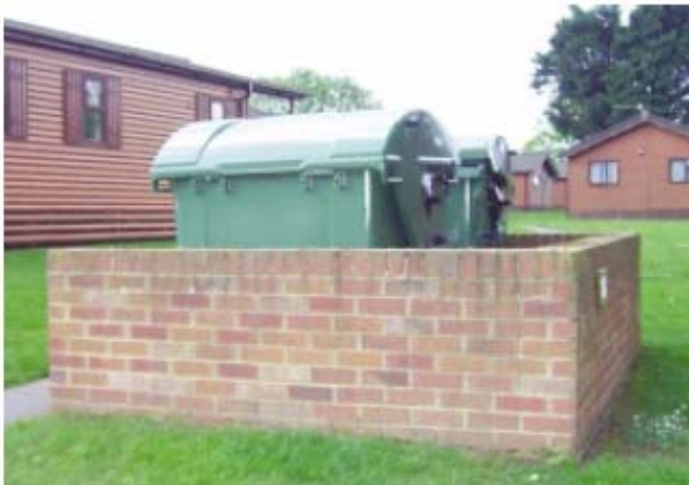
A contained, allocated space. However ...

Design note: Communal external bin stores for 1100 litre bins must allow at least 150mm clearance around each bin, with a minimum of 1m clearance if the bins are located facing each other. Screening must be provided to a height of at least 450mm above the top of the bins, and can take the form of landscape features including fencing. All communal waste storage areas should be sited to avoid any nuisance arising from odours, noise etc. and should have appropriate drainage to assist cleaning.