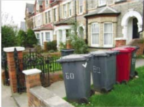
This example of existing development highlights problems arising from development of flats.