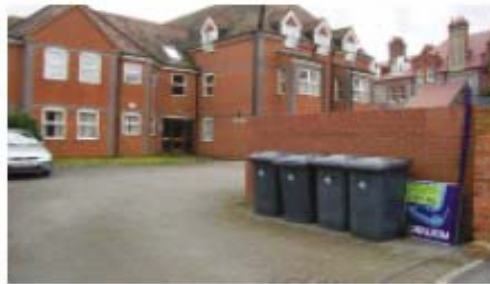
Not really what you want to see at the principal entrance to a block of flats.