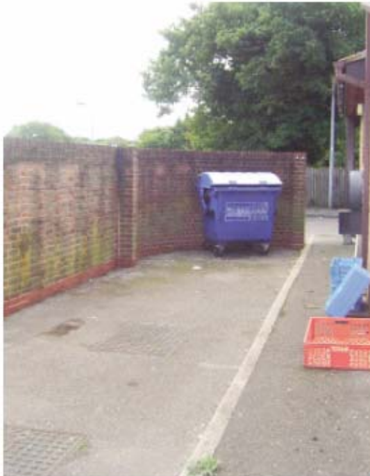
Good example of rear serviced shops with allocated/ designed space.