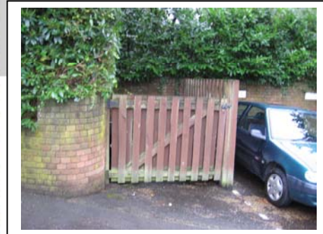
Here bins waste storage facilities have been tucked discretely between pedestrian and vehicular access, into the corner of a parking area, screened from the street public areas by fence and wall and from the windows of the house by shrub planting.