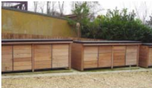
Here the storage of bins waste has been considered. The enclosures are designed to match the architectural language of the buildings.