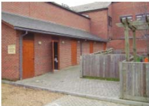
A series of enclosed bin stores waste stores for a multiple flat development have been built against an otherwise blank wall. The enclosing structure picks up reference particularly in terms of materials from the main development.