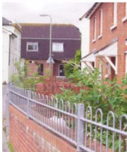
On the same development whilst the design intention is good the execution doesn't meet expectation. Doors on the front of the enclosures might have produced a better end result.