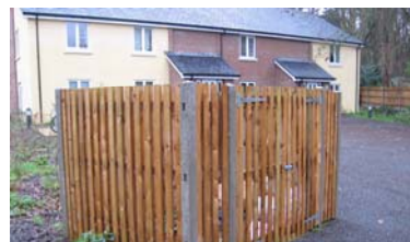
A communal store screened from the surrounding open space